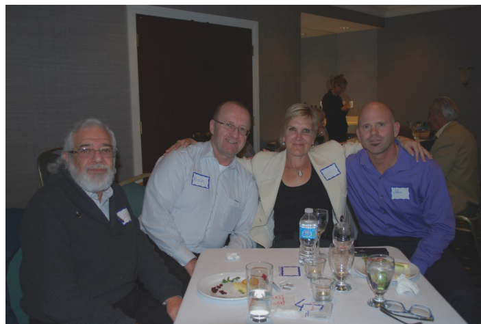
ANAC members mingling with ANAC President and Board Members

The night before the symposium, there was a meet and greet held at The Marriott hotel located in the heart of downtown Toronto. It was a chance for newly diagnosed members to make their introductions, old members to reconvene, and board members to meet those who are at the core of ANAC.