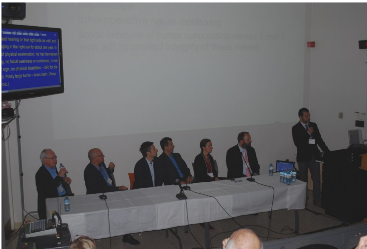
Medical panel and audience Q&A period

The symposium featured Communication Access Real-Time Translation (CART) used to close-caption the entire event for audience members with hearing difficulties. Attendees had the chance not only to learn from leaders in their field but also to interact with the speakers through question and answer periods and audience led discussions with the medical panel and ANAC's medical advisory board.